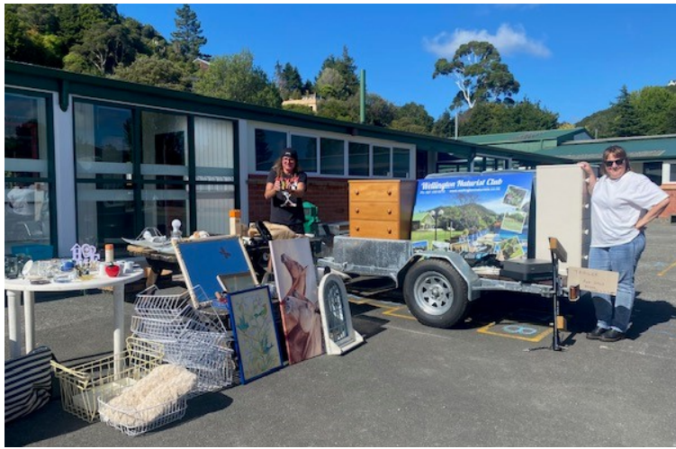
WNC recently participated in the Plateau School Car Boot Sale with some success!