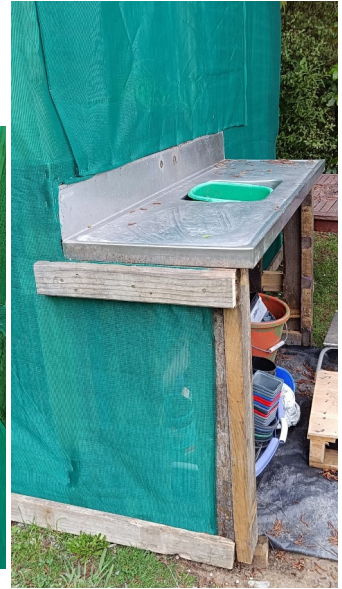
Inside the new shade house/nursery and potting bench