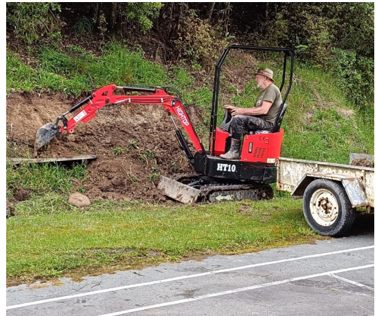
WNC is so grateful to members giving their time and equipment so freely—Rex completing the start/end of the new walking track