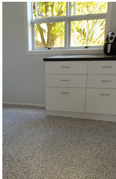
The FAL shower block and camp kitchen new floors. Not only are they smarter, they will be easier to clean, more enduring and considerably brighter up these areas