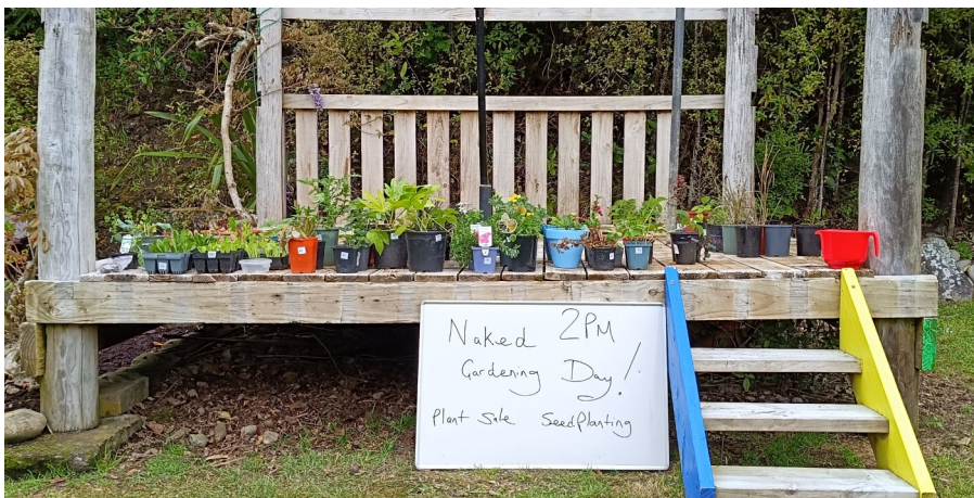
Unfortunately the weather was not in the least bit suitable for Naked Gardening Day but a few brave souls purchased some plants - funds go towards providing the flowers around the main lawn. There are still a few plants on the old fort for sale. If you are interested in buying natives from the shade house please see Claire