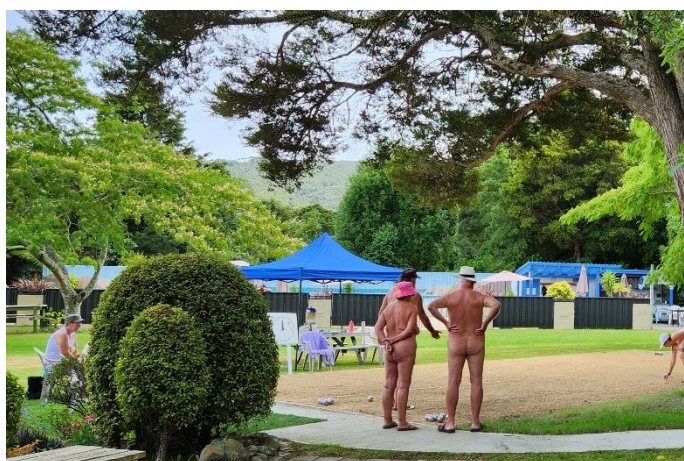
Even the drizzle didn't dampen the sporting spirit