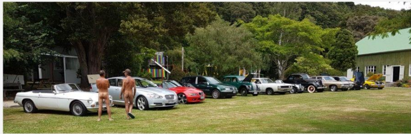
Photo from previous car day held January 2020

Bring your special wheels along Vote for your favourite classic and modern car