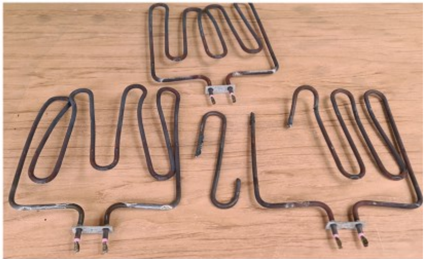
Old elements - they're not supposed to be bent (or broken!)