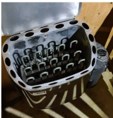
New elements installed