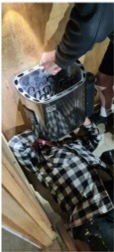
Taking apart sauna heater

Do not set the timer or thermostat to the maximum, as it will just waste power and not heat up any faster.