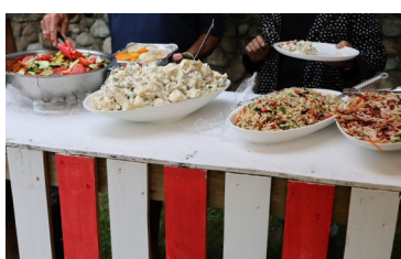
Daily Salad Bar