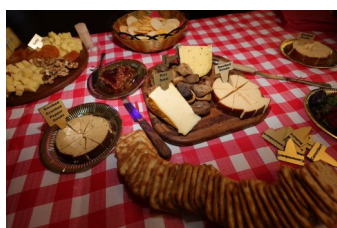
Wine & Cheese evening