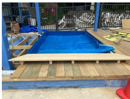
Nearly there. Decking trim being added around the hot tub

Please take all personal items with you when you leave.