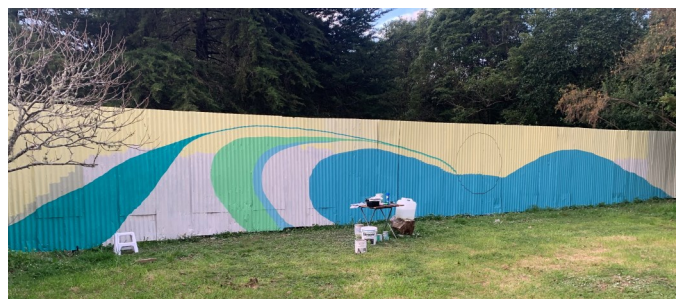
Following progress on the fence mural