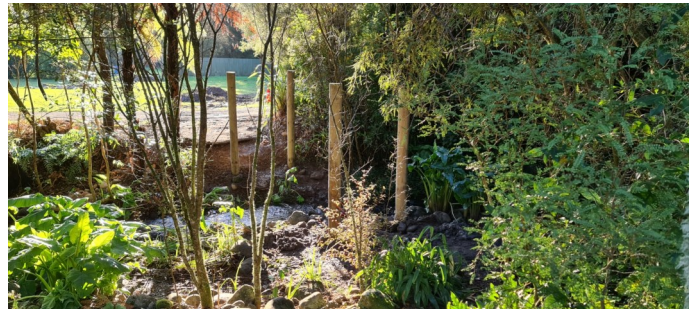
Poles in for new footbridge from visitors parking area

If you notice anything that needs attention please let Ken know on 021 152 5940.