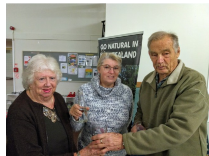
Enjoying pre dinner drinks