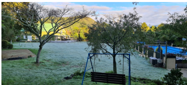
A frosty start to the day

The committee would like to remind members to be ever vigilant when entering the grounds.