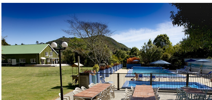
Dreaming of those long sunny days

Please ensure no tailgaters follow you in, unless you know them.