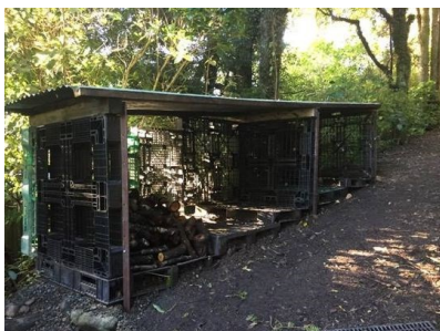
New wood shelters for BBQ