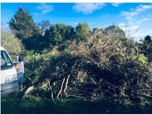
Ever growing pile of tree trimmings