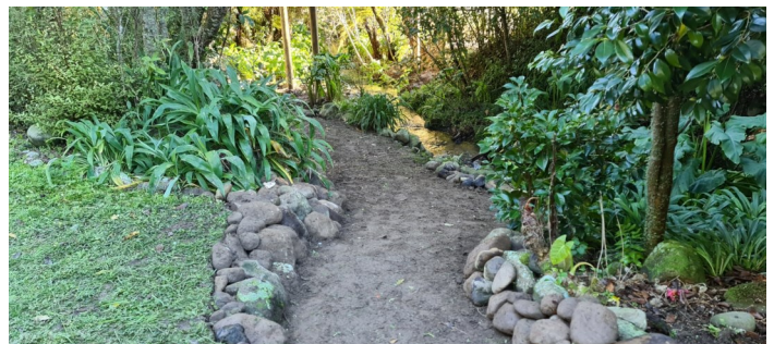
Path from footbridge to the Lower Dell then up to main lawn