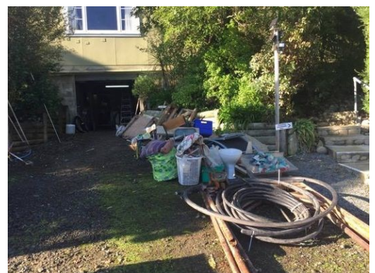
Garage clean out