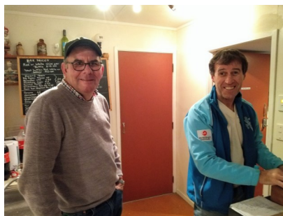
Busy in the bar

No visitor fee applies, only the cost of the dinner.