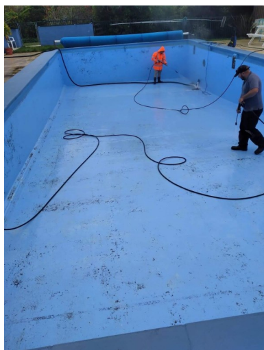
Contractors water blasting the swimming pool

now graduated to full membership We wish you a long and enjoyable time at our club