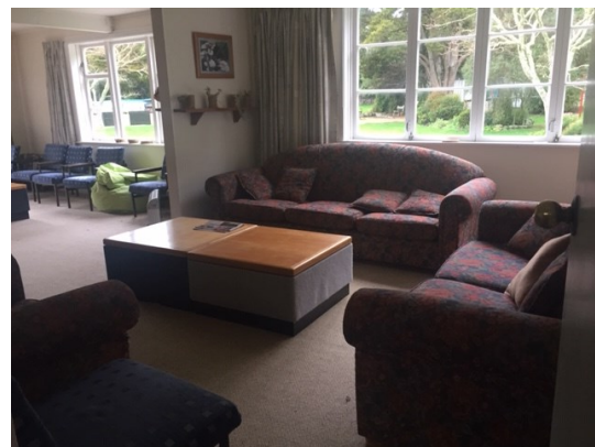
Check out the new cosy lounge area

Following dinner, the very popular Quiz Show hosted by Murray and Sarah