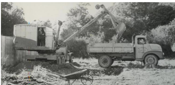
1957 Digging began for the swimming pool.

See posters further on in the newsletter